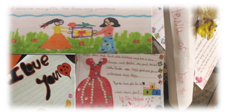
Figure A.1. Generated Data from Meaning Focused Group Compositions