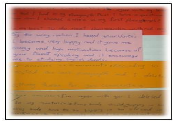
Figure A.2.Sample Colored Paperboards attatched toCompositions