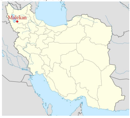
Figure 1. Location of the Malekan city in Iran

Malekan is a city and capital of Malekan County, East Azerbaijan Province, Iran. This city with a population of 27431 people based on 2016 census is ranked as the thirteenth most populous city in the province (Statistics Center of Iran, 2016). Malekan is located in the southeast of Lake Urmia, at the junction of East and West Azerbaijan provinces. This city has an area of 1007 square kilometers and its distance from the Tabriz is 144 km. The location of the studied area is illustrated in Fig. 1. The Malekan people are Azerbaijani landlords and speak Azerbaijani Turkish. Malekan climate is influenced by the Urmia Lake which currents cause rain and sometimes snow in spring, autumn and winter (Azarafza and Mokhtari, 2013). The most important industry in Malekan is agriculture and people are generally farmers and ranchers. In term of geological aspect, the Malekan located on the Quaternary alluvial which include detached sediments and organic/inorganic soils. The alluvium is the main in agricultural pastures classified in the fine-grained soil included clay to silt soil and sand. The clayey soil is the most important part of the described soils and mainly contained smectite group (Azarafza and Ghazifard, 2016)