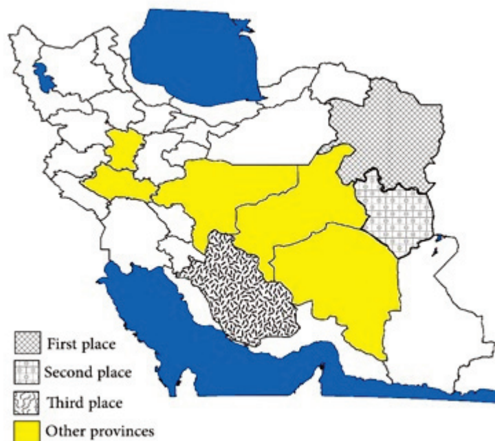
Figure 1. The location of Saffron planting in Iran

Saffron cultivation processes in Iran can be generally divided into three basic stages. The first stage is dedicated to planting saffron bulbs. For this purpose, lands are plowed and weeded in spring and early autumn, and saffron bulbs are planted. The second stage includes the growing process. At this stage, in early October, manure is added to the soil and a surface plow is performed. Irrigation and weeding are the requirements of this step. The third stage is related to harvesting saffron flowers. One year after planting saffron bulbs, saffron flowers are ready to harvest. The saffron blossoming period is usually in early November. Within 10 to 15 days, each saffron bulb gives an average of six flowers (Mirza in Rajabi et al., 2015). However, despite all its advantages, saffron cultivation