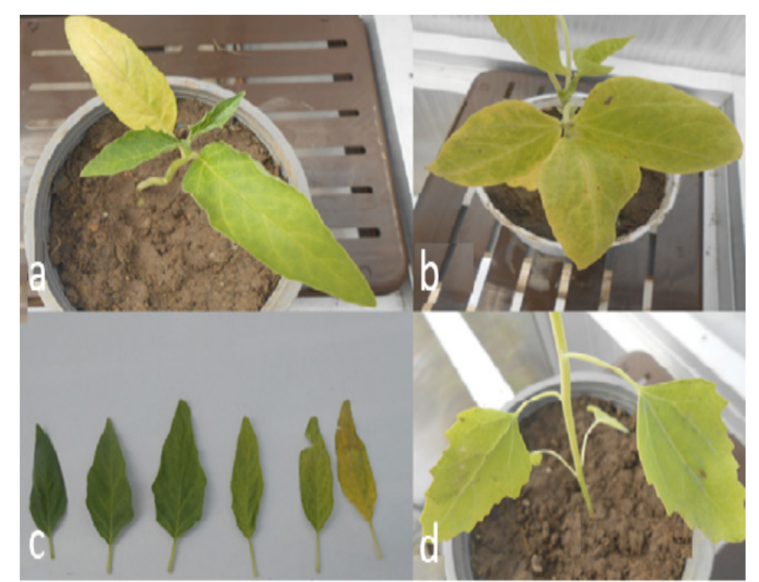
Fig. 3. Symptoms of infection to TSWV. (a) Systemic chlorosis in Datura stramonium L. (b) Systemic yellow vein of leaves in Vigna unguiculata L. (c) Mild to severe chlorosis in Datura stramonium L. (d) Local necrotic spots and Systemic mosaic in Chenopodium album L.

The results of RT-PCR using specific primers to detect TSWV are presented in Fig. 4. In this way, a region of the TSWV genome RNA-L was amplified and a fragment of 276 bp of the infected Chrysantheum indicum (L.) Lam. sample was obtained. These tests conclusively proved the presence of TSWV in the province.