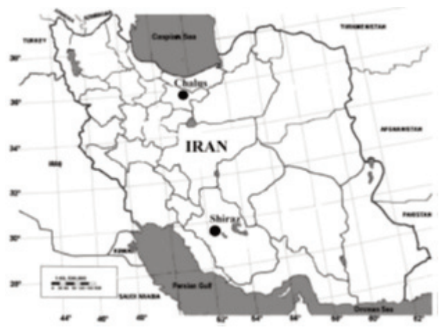
Fig. 1. Sampling location of rootstocks and flowers of Rosa iberica plants in Chalus and Shiraz, respectively.

Extraction from dry petals of R. iberica showed 13 constituents, i.e., Monoterpene (Dllimonene), monoterpene alcohol (linalool), oxygenate sesquiterpene ( \alpha -thujone), phenol (eugenol), alkanes (eicosane, tricosane, pentacosane and 2,6-dimethyloctane), fatty acid (butanoic acid), terpenoid (camphor), aromatic compounds (1-methoxy-4-(1-propenyl) benzene and 1-methoxy-4-(2-propenyl) benzene), and benzoic acid (1,2-benzenedicarboxylic acid). The main components were 1-methoxy-4-(1-propenyl) benzene (45.56%), 1,2-benzenedicarboxylic acid (32.23%) and 2,6-dimethyloctane (7.09%) (Fig. 3, Table 2).