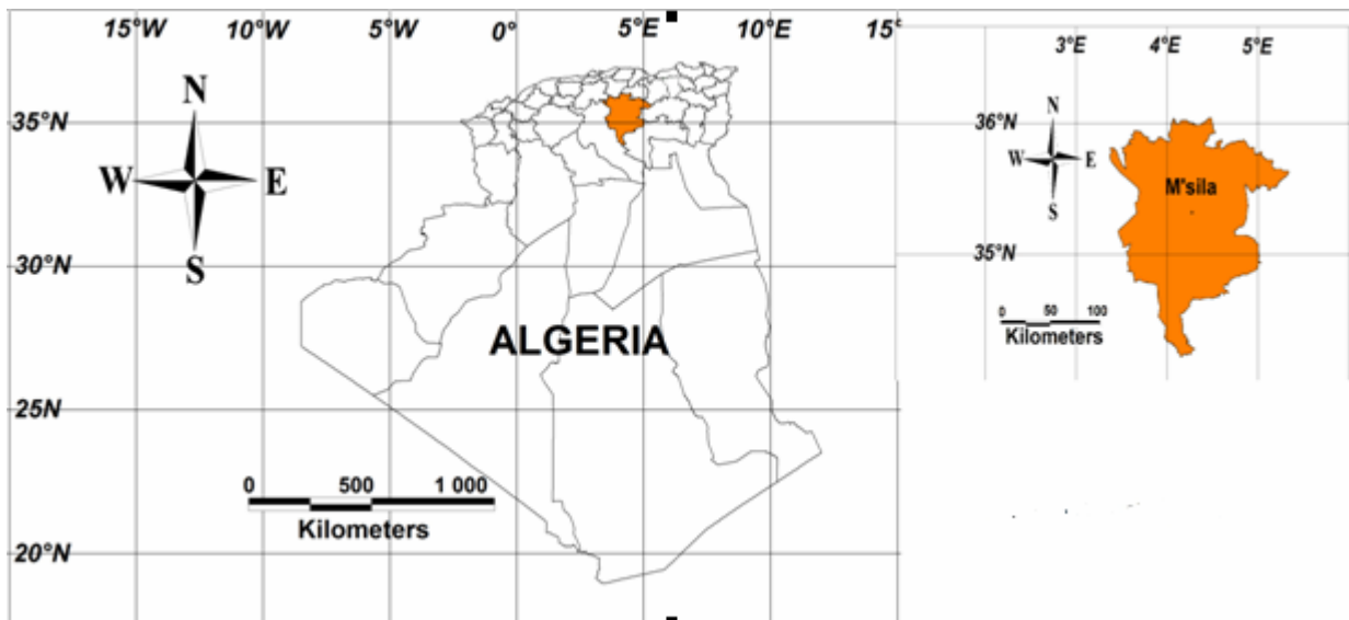
Figure 1 The study area