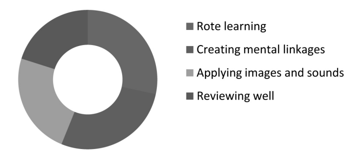
Figure 2. The percentage of each of the strategy categories

As it is illustrated in the Table 1, although for group one rote learning strategies had the top rank among all categories of memory strategies, the difference between rote learning strategy and creating mental linkages is negligible. In other words, these two strategies can be considered at the same level. They are followed by applying images and sounds m= 3.7 and reviewing well m=3.14. The total mean of different categories of memory strategies was 3.9 for group1 students. The percentage of each of these strategy categories is shown in Figure 2.