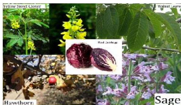
Fig.1. Medicinal plants

Comparing results of free radical scavenging percentage in the presence of ethanolic extracts of Sage, Red Cabbage, Walnut Leaf, Yellow Sweet Clover and Hawthorn one by one and mixtures of each pair of plants with same concentration at temperatures ranging from 25°C to 40°C, on the basis of data were measured by UV-Vis spectroscopy, are summarized in Table 1. The results provided in Table 1 show that the highest free radical scavenging percentage was the ethanolic extract of Sage at 25°C and with increased temperature decreased free radical scavenging percentage, while the lowest free radical scavenging percentage of Sage extract related to 40°C. Walnut leaf extract was more effective than 3 other single extracts against free radical and different temperatures have no significant effects on them. However, Red cabbage extract has weak free radical scavenging at all temperatures except for 25°C.