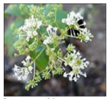
Fig. 1. The inflorescence of Spermacictyon suaveolens (Kavita et al. , 2016).

A medicinal plant shrub species Spermadictyon suaveolens Roxb. (S. suaveolens)(Fig.1) belongs to the family Rubiaceae, found in the Indomalayan region and China (Govil et al. 1993) as well as Northern areas of Pakistan (Perveen and Qaiser, 2007), and it grows up to 12 ft. Also, it can be cultivated in the garden for ornamentals purposes. It has been practiced by ancient medical systems for the treatment of the dermatological disorder (cuts, wounds, boils, foot cracks, burns) and colic, gastrointestinal disorders (stomachache, vomiting, cholera, digestion, dysentery, constipation) (Singh et al., 2014). The leaves of S. suaveolens are found to be more effective against wounds, cholera, and diarrhea (Gaur, 1999; Pande et al., 2006). A very few literary works are available in search of "pharmacognosy of S. suaveolens" such as Kavita et al. (2016) who investigated the phytochemical characteristics and antioxidant activity of the stem of this plant. Further chemical evaluation of the plant parts is required to document their efficiency and better utilization.